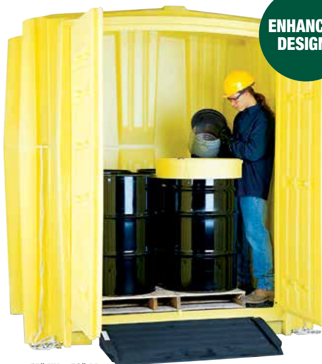
Door opening 57" W x 78" H