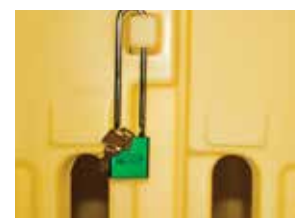
Newly updated lock & handles.