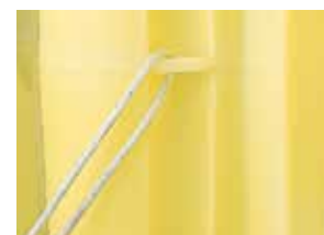
Tie-down feature for secure anchorage.